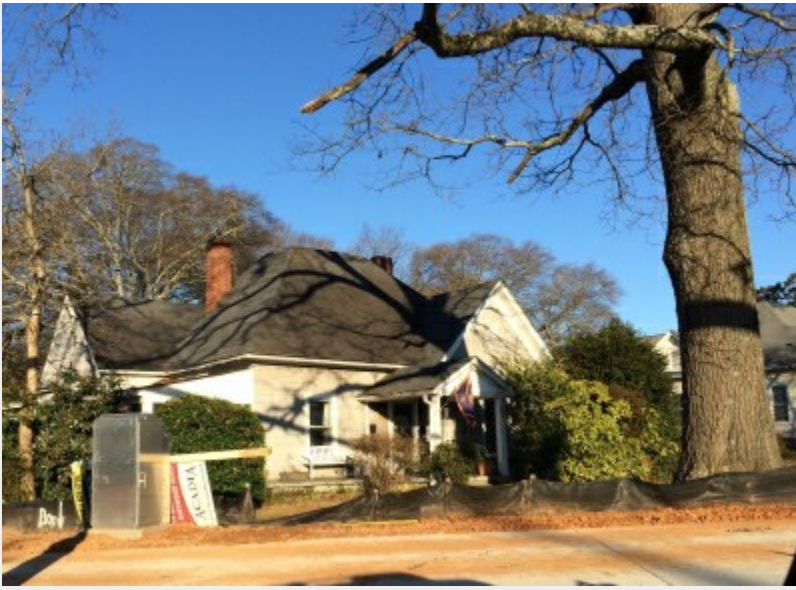
2986 King St (view from King)